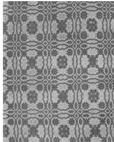
Whig Rose and Chariot Wheel