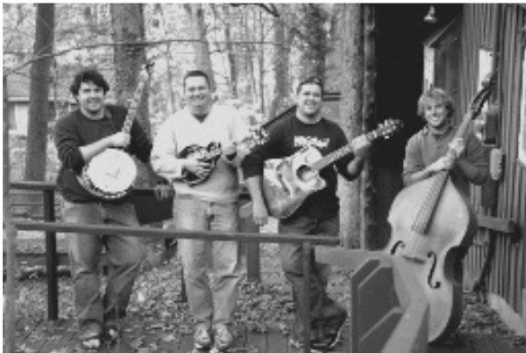
The Lost River Pilots