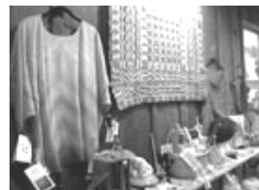
Little Loomhouse Gift Shop